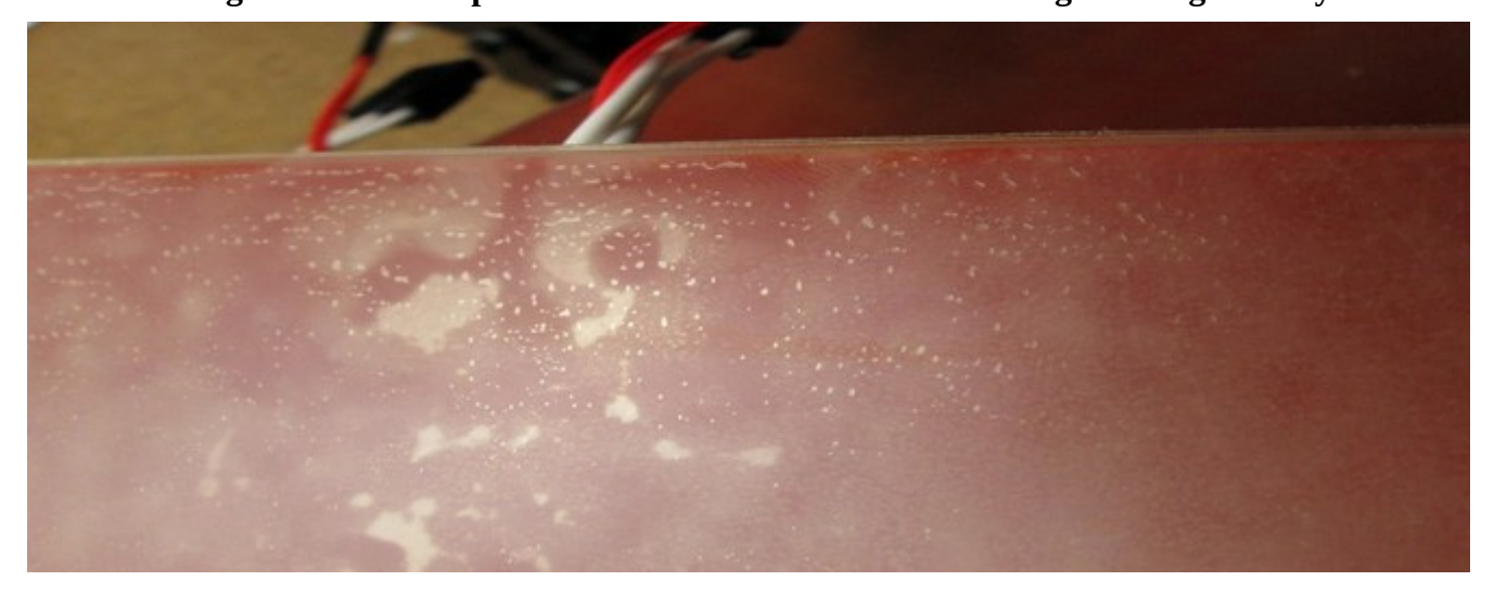
Image 2: acceptable levels of heat pad delamination over the wires. The small amount of interconnecting bubbles is acceptable and normal within 1/4" of the edge of the glass only.