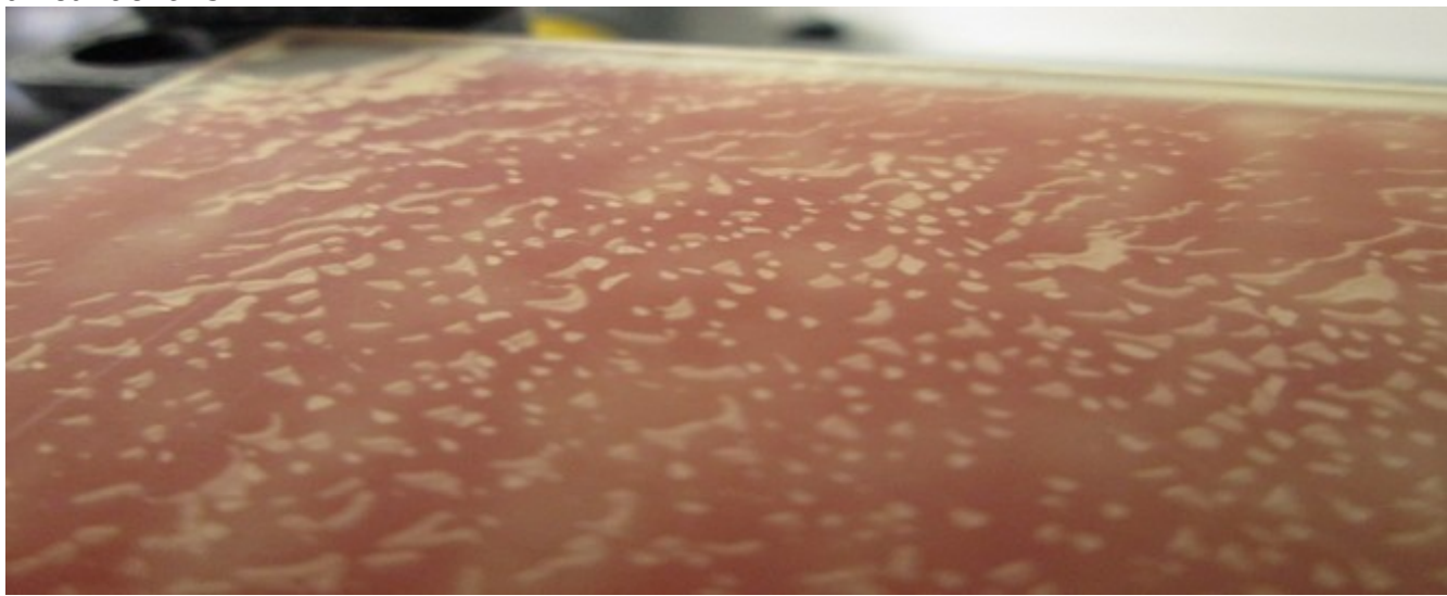
Image 1: Example of the bubbles forming together - Reject any beds that have a significant amount of this