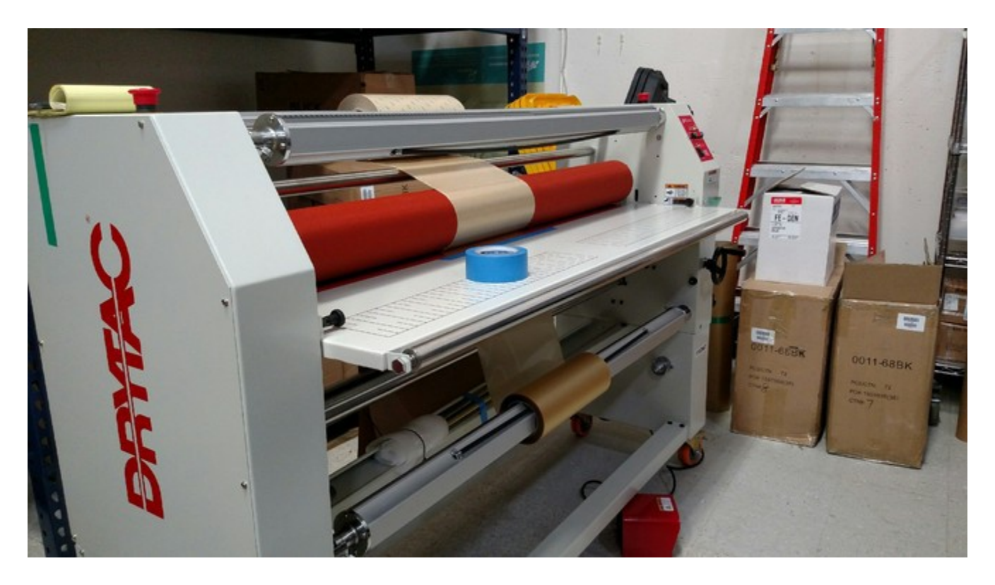
Step 1: Laminate adhesive to PEI